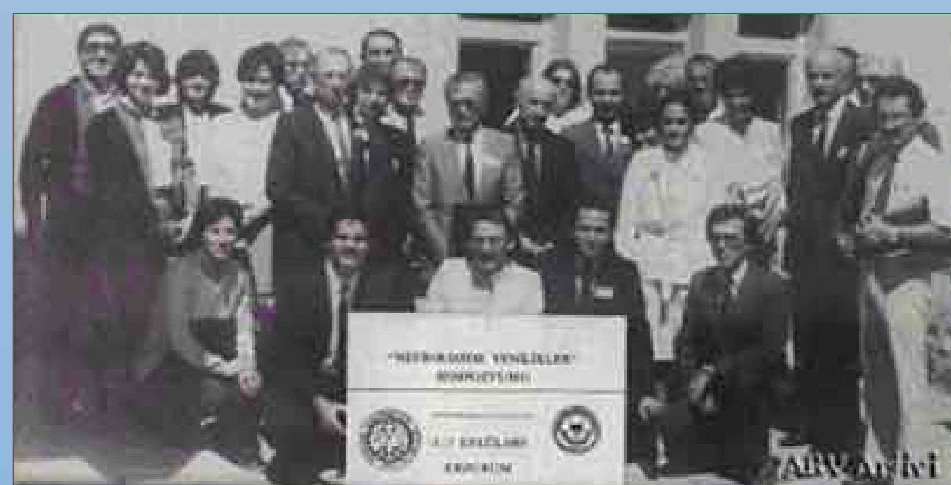
The 2nd Nephrology Congress in 1985.