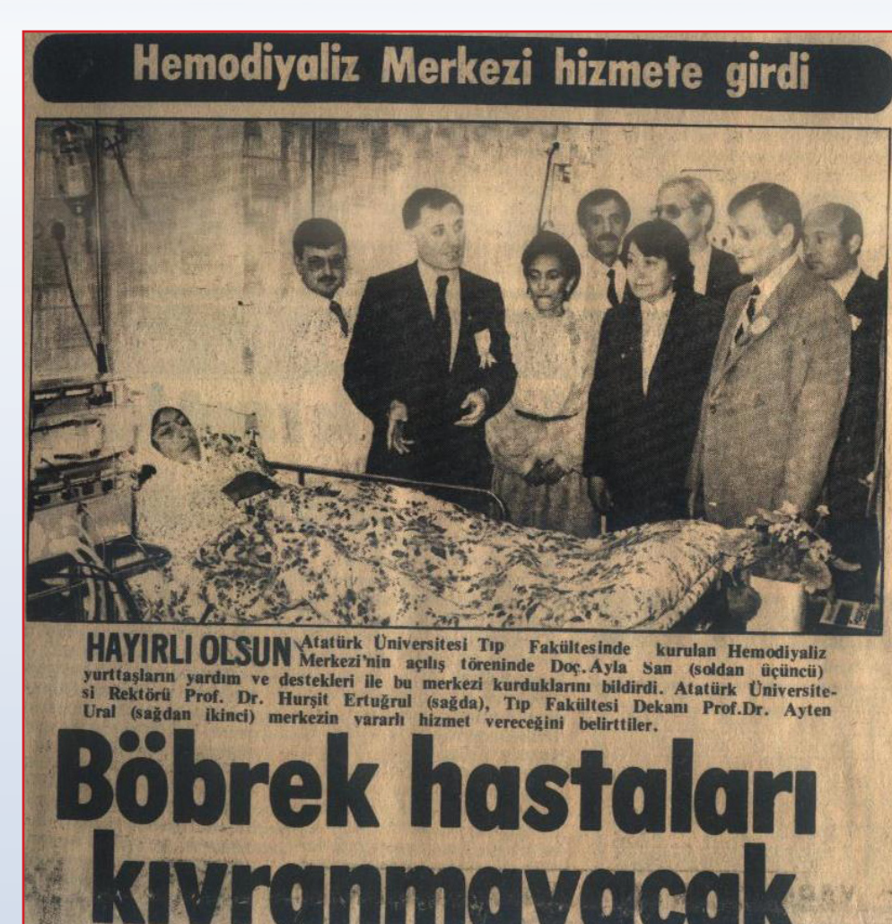
Kidney Disease That Will Not Suffer Anymore