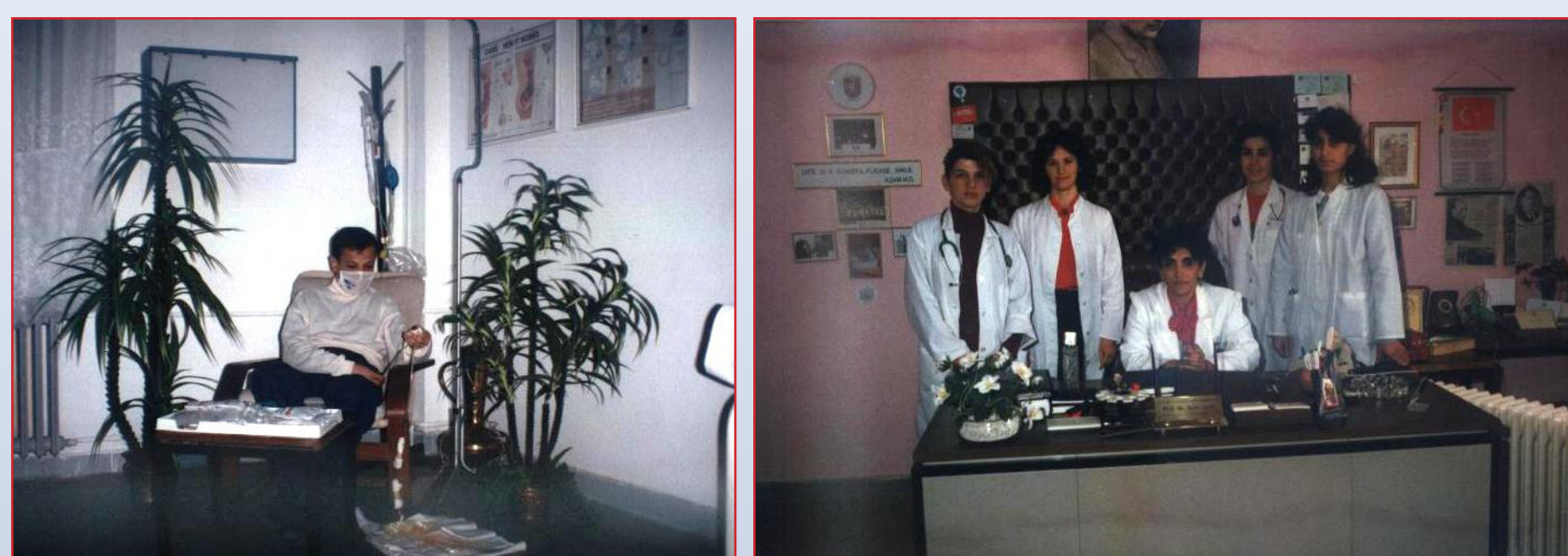
First CAPD Studies