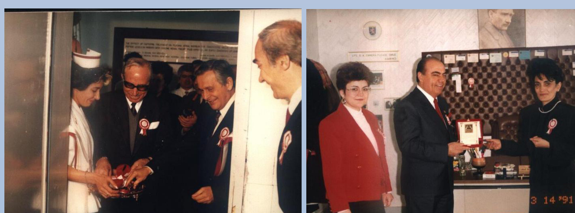
Queen of the Orient Foundation

She opened several dialysis centers associated with the foundation, particularly in Gümüşhane and Kars, and contributed to the establishment of them. She was in charge of dialysis in Eastern Turkey training many doctors, nurses and technicians, also being a board member for a long time.