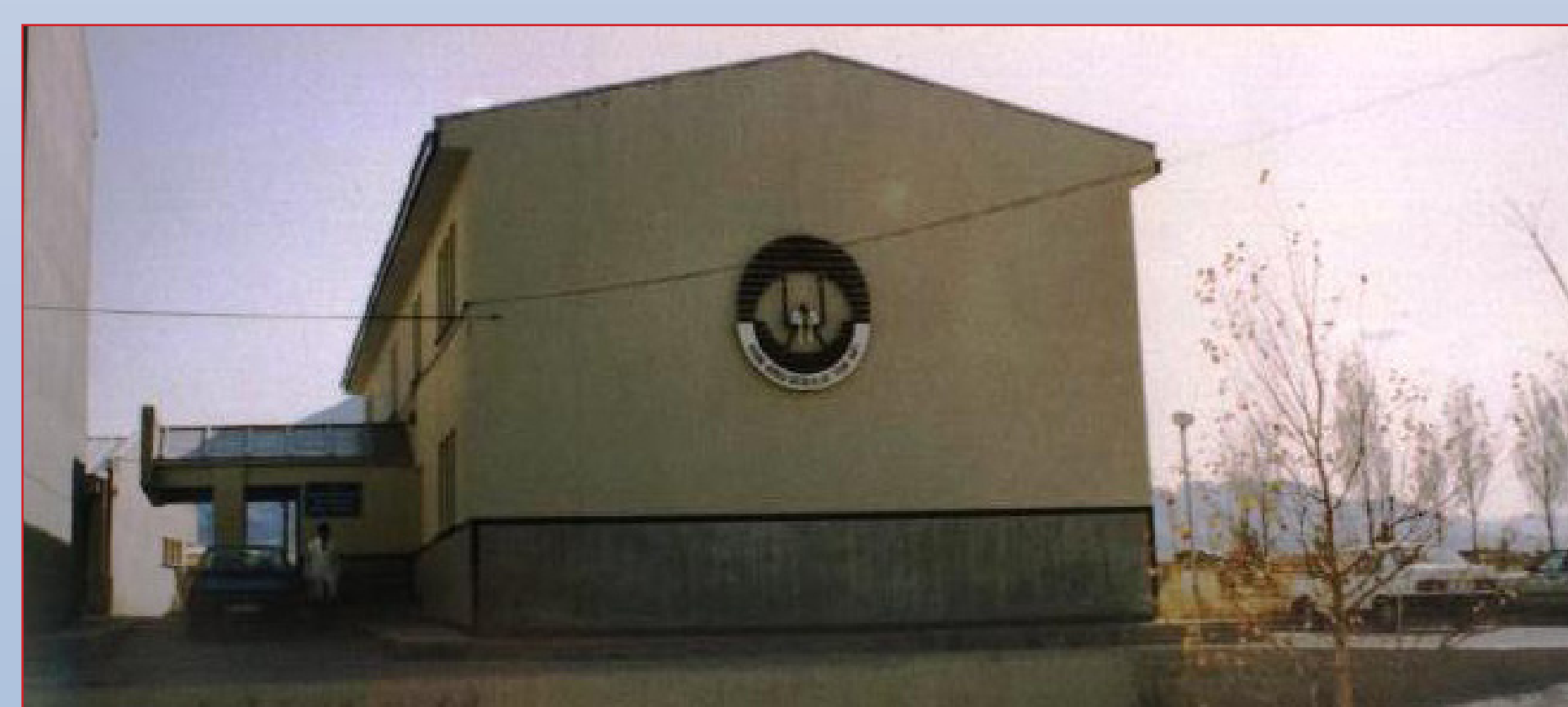
The Hemodialysis Center

A modern, two-storey dialysis center opened in 1984 with the support of the foundation.