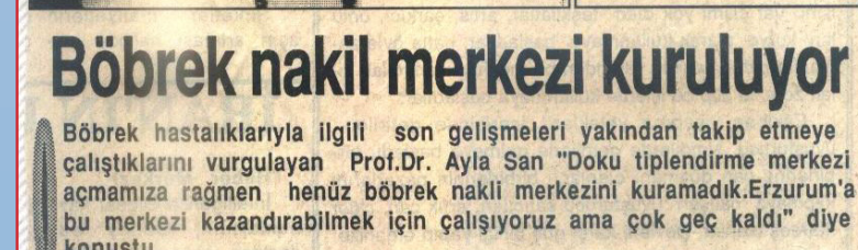
Kidney Transplant Center Being Established