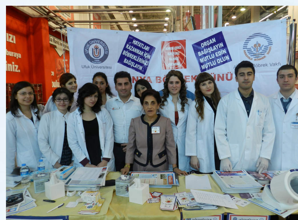
Our activities in KENTPARK Mall