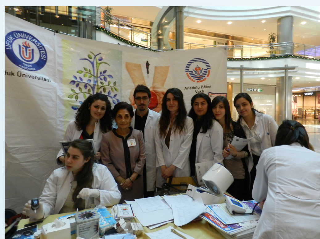
Our activities in CEPA Mall